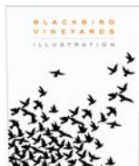
Illustration Napa Valley Proprietary Red Wine