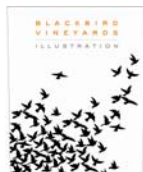
Illustration Napa Valley Proprietary Red Wine