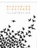
Illustration Napa Valley Proprietary Red Wine