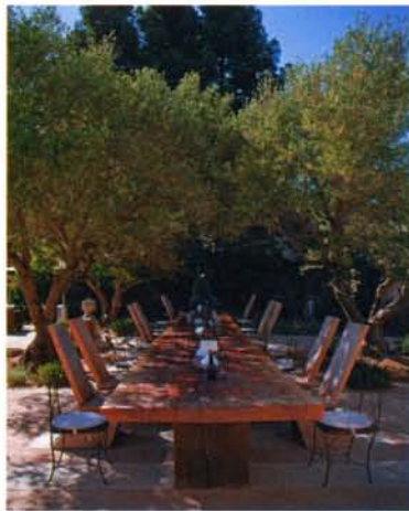
A tasting table in the sun-dappled courtyard of Ma(i)sonry.