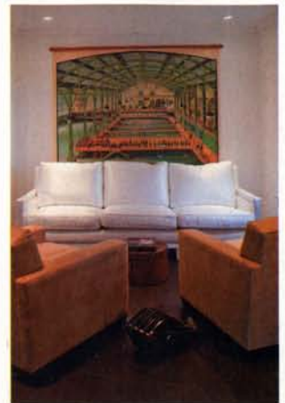
A sitting room at Blackbird Winery offices in Napa.